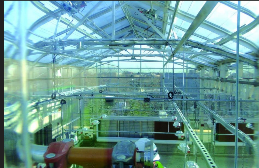
BMCC and Lehman College Environment Sustainability